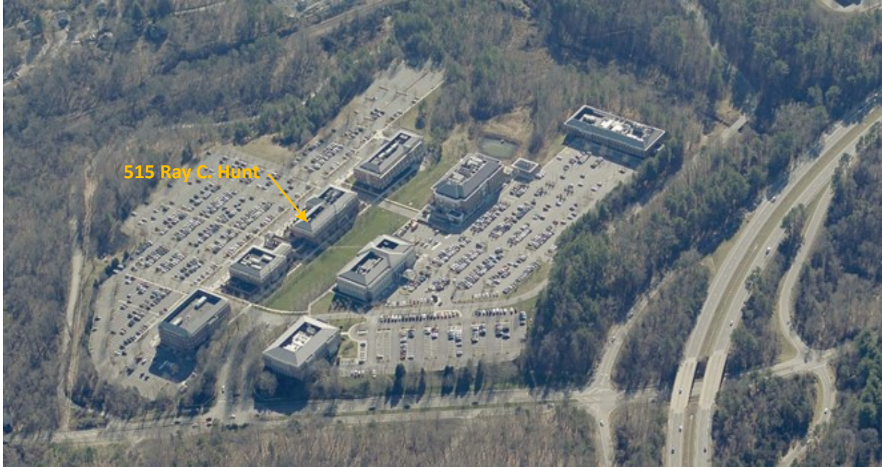
Current aerial view of Fontaine Research Park