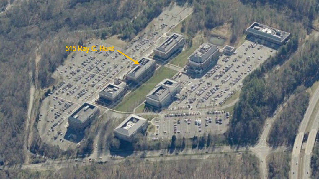
Aerial view of Fontaine Park