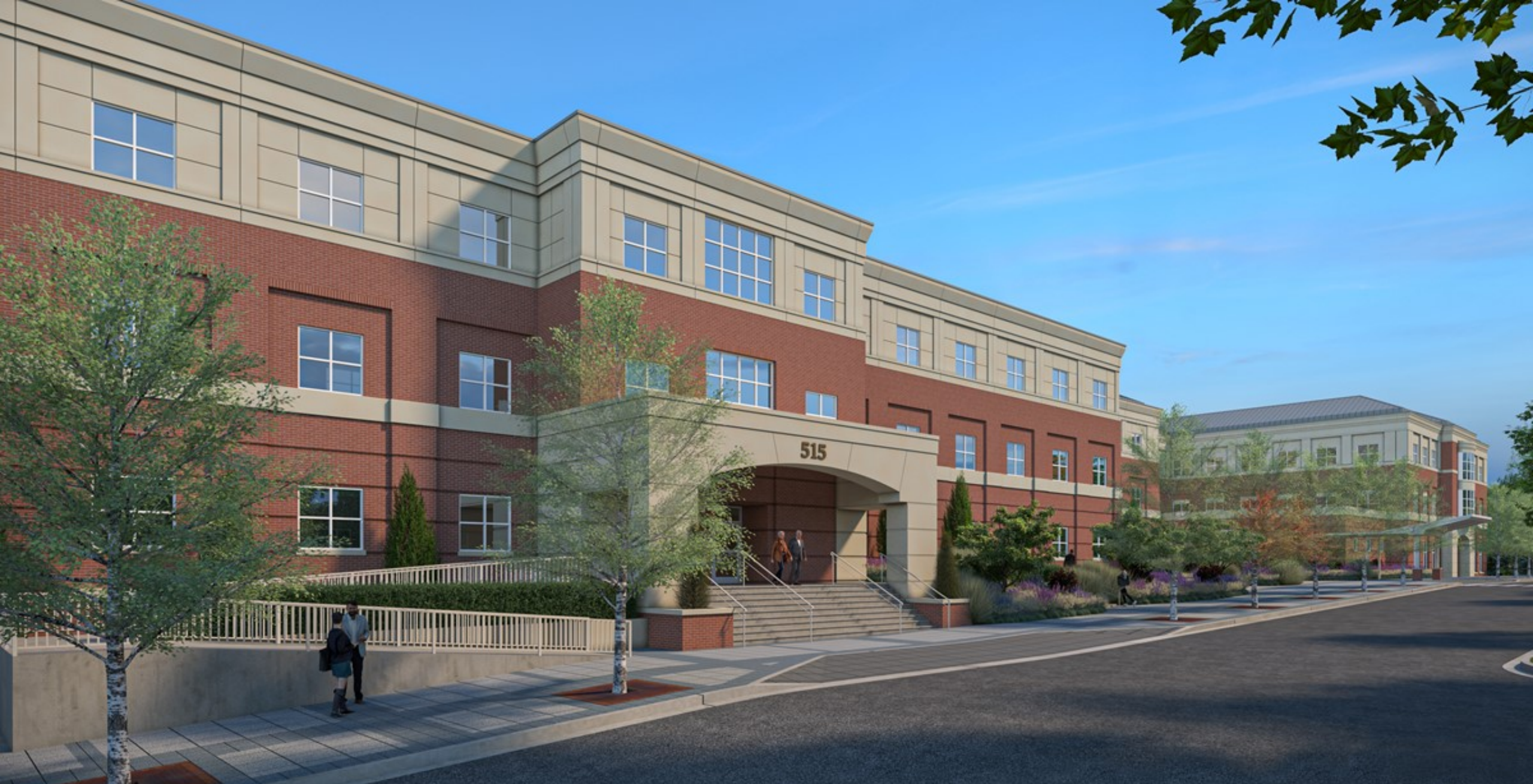
PROPOSED NORTHWEST VIEW