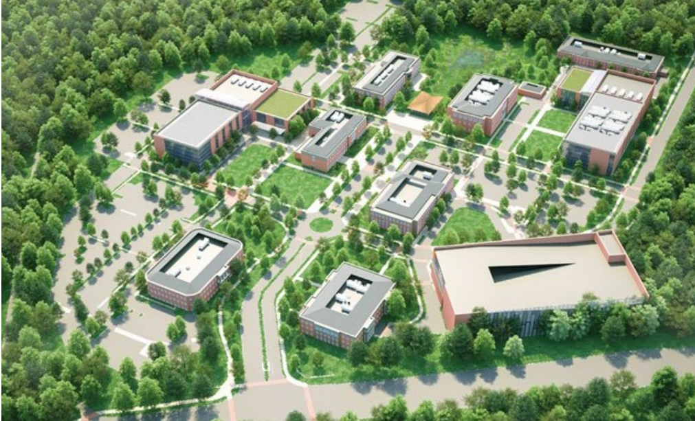
Fontaine Master Plan