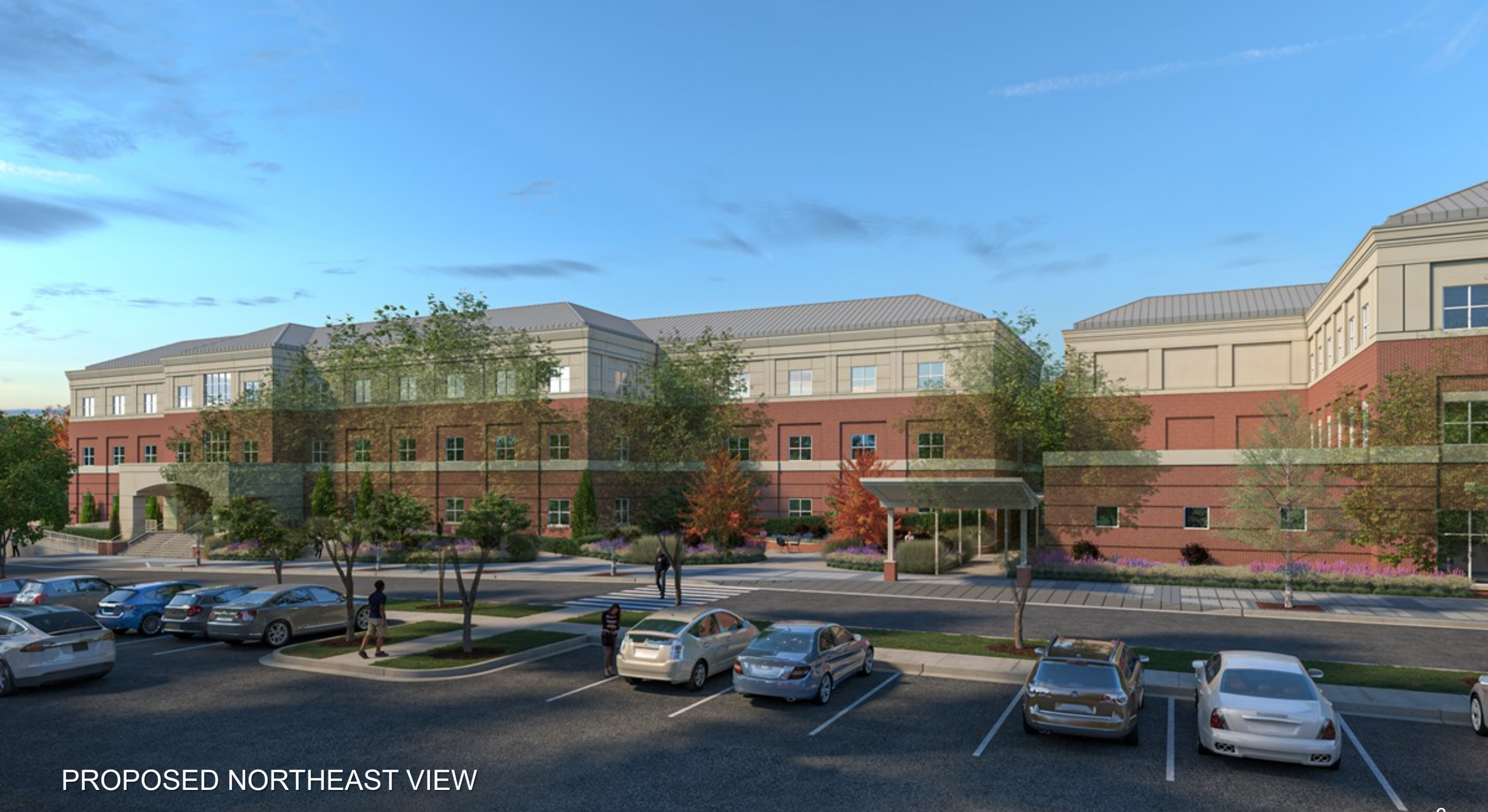
PROPOSED NORTHEAST VIEW