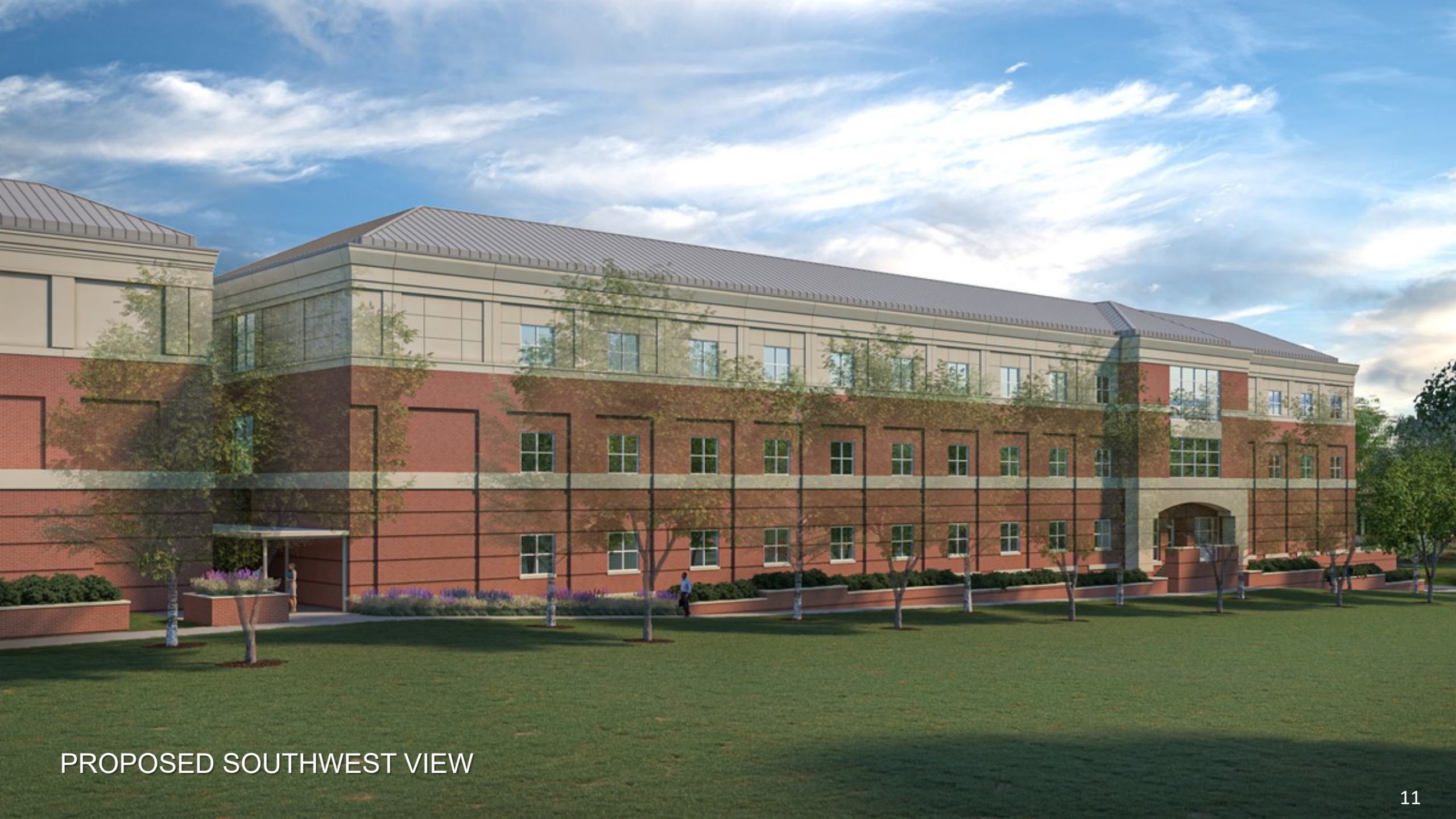
PROPOSED SOUTHWEST VIEW