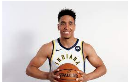
Malcolm Brogdon Professional Basketball Player