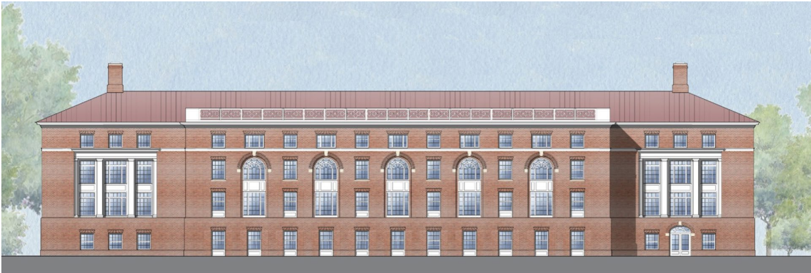
BUILDING A - EAST ELEVATION