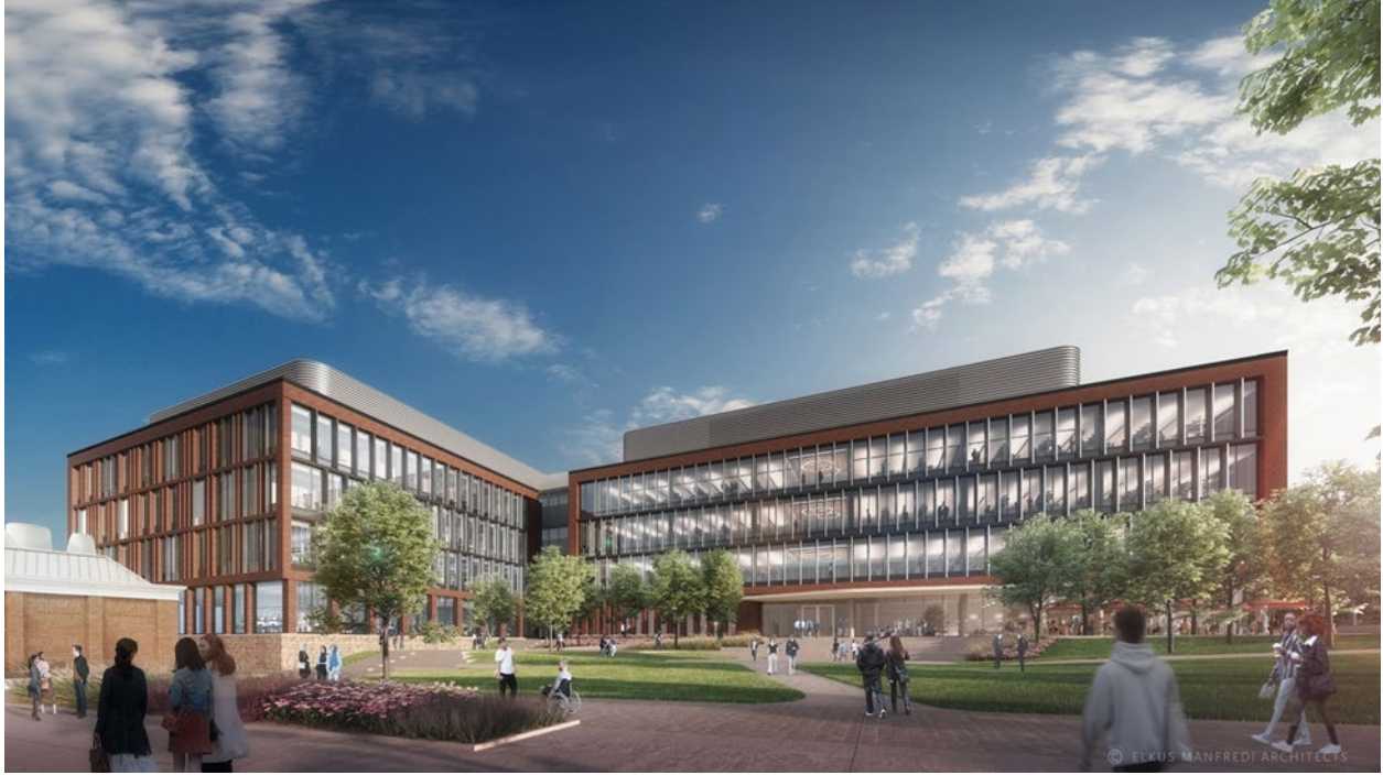
View from Snyder looking west