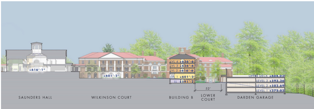
Site section through Saunders Hall, Wilkinson Court, and the Darden Garage