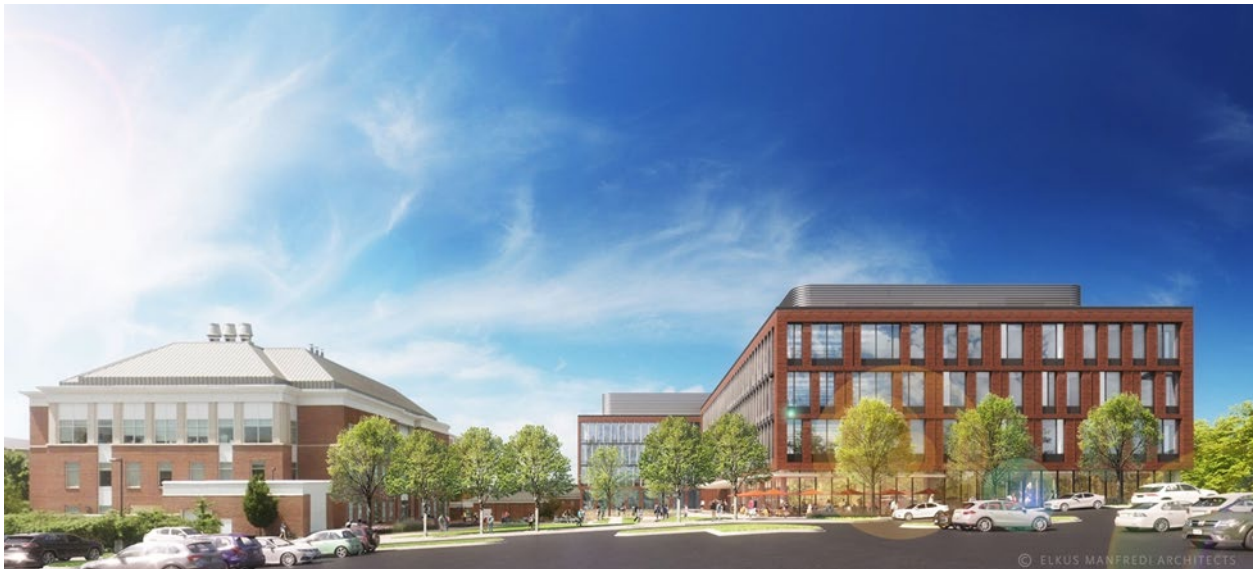
View looking south