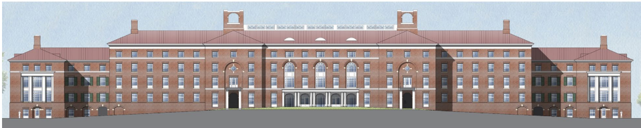
BUILDING B/C/D - SOUTH ELEVATION