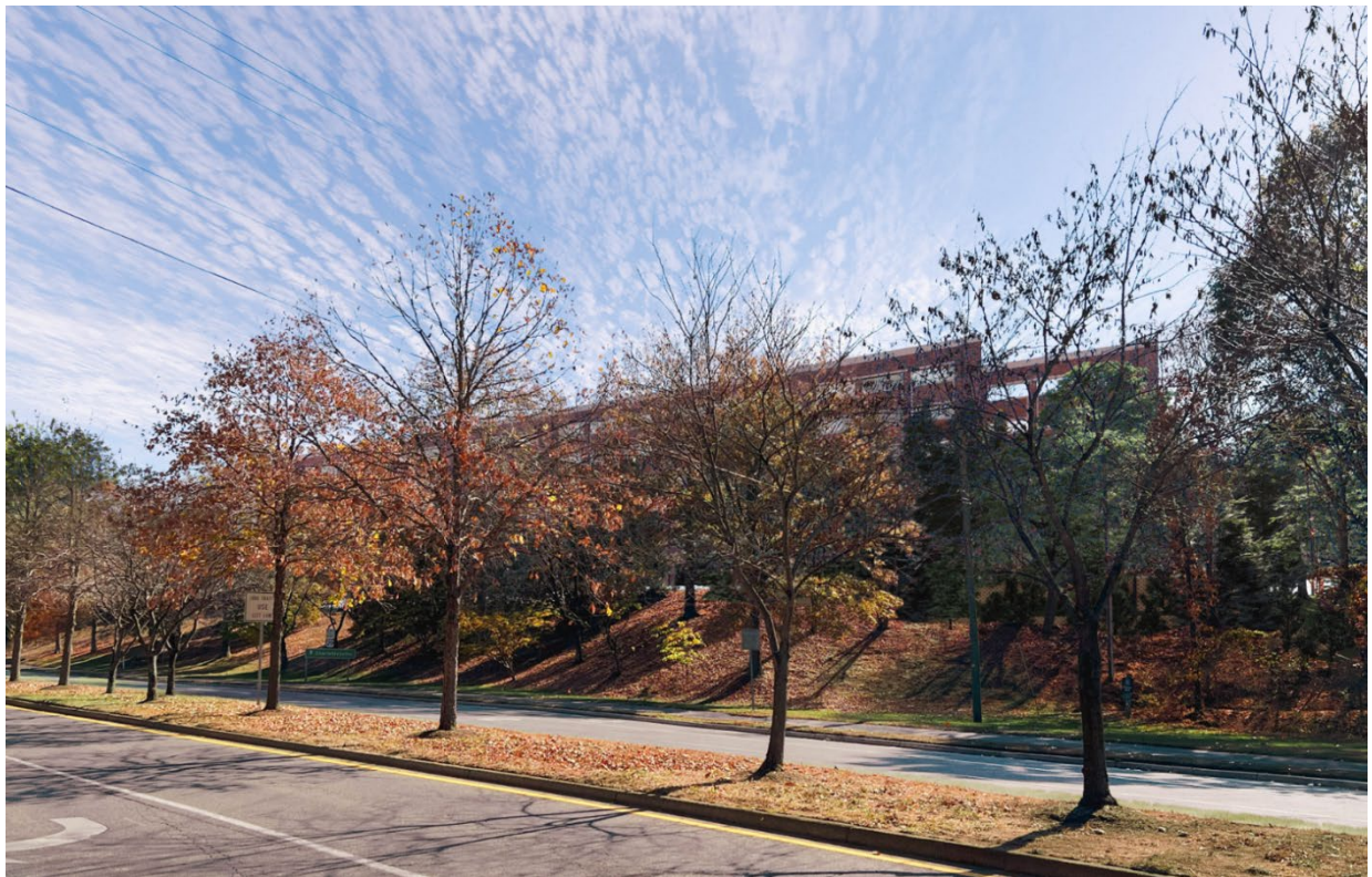
View of Parking Garage looking southeast from Fontaine Avenue