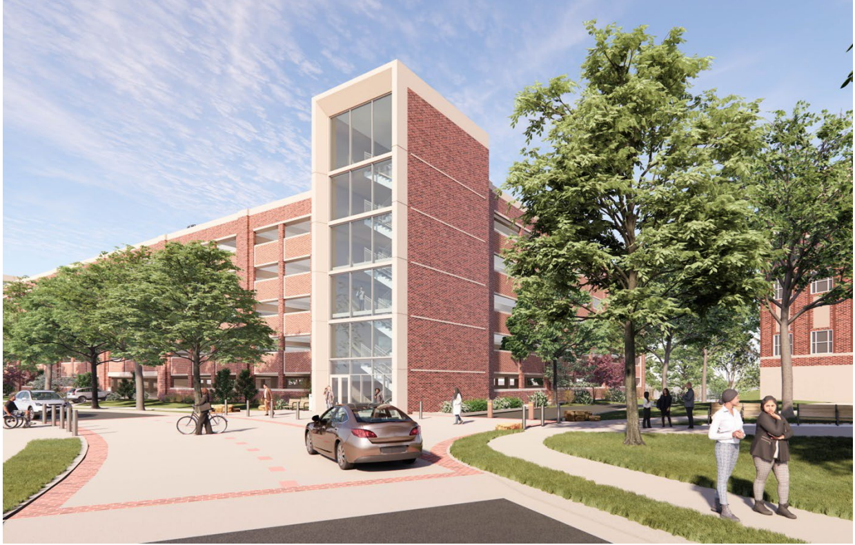
View of Parking Garage looking northwest