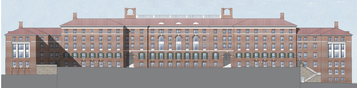
BUILDING B/C/D - NORTH ELEVATION