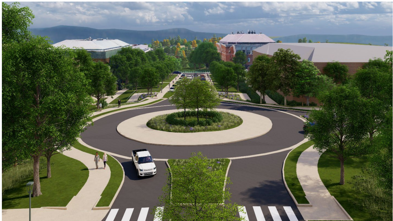
View of Roadway Improvements upon entering the Fontaine Research Park