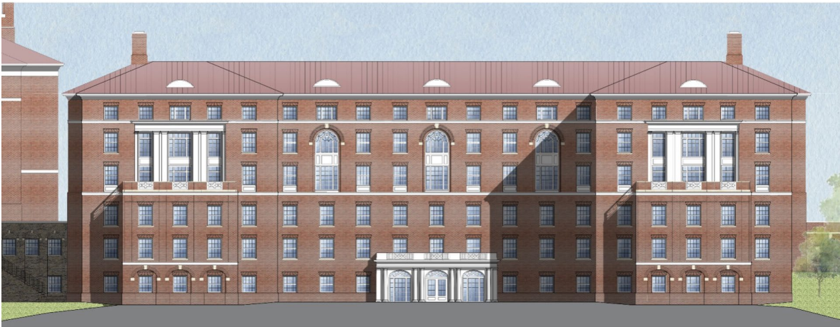
BUILDING A - WEST ELEVATION