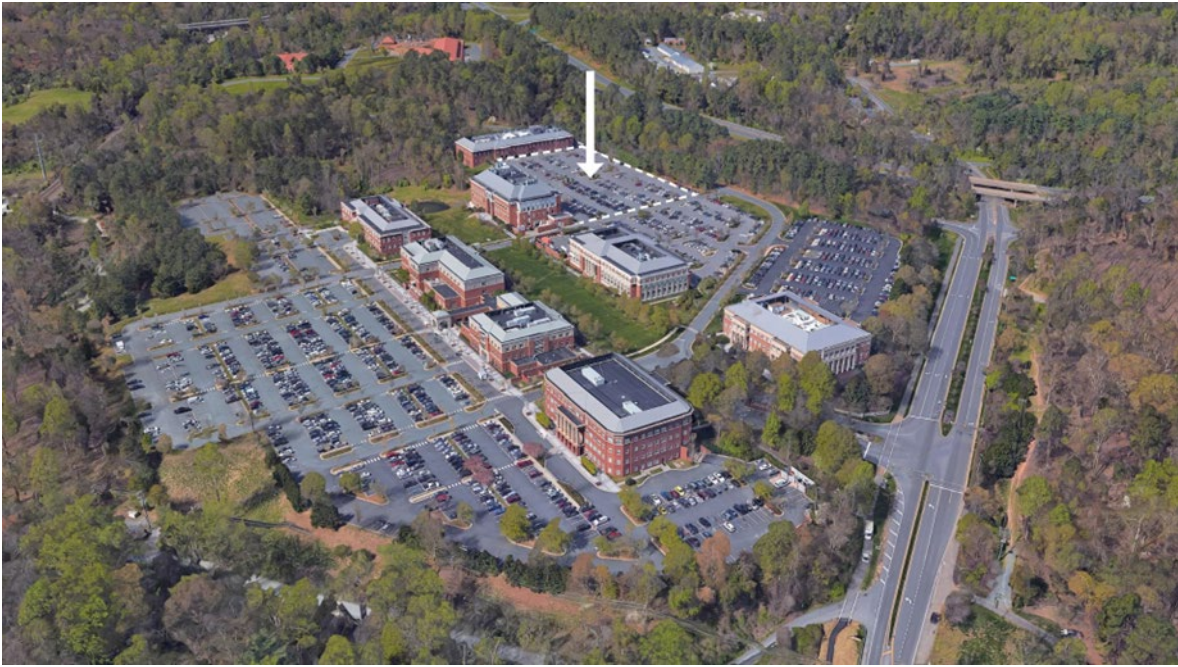
Aerial view of site