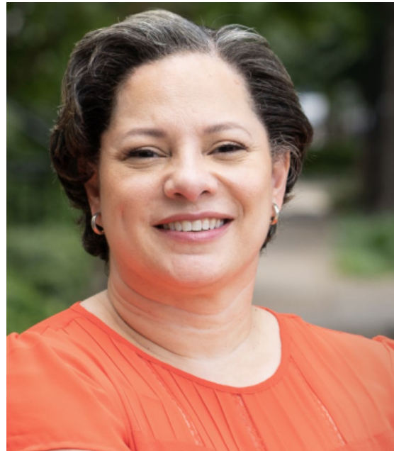
Jennifer McClellan (D), U.S. Representative Political Leaders Program alumna